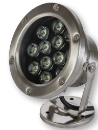
LED LIGHTS OPTIONAL