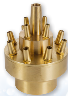
BRONZE LOTUS NOZZLE