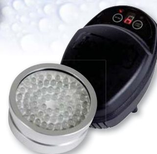
LED LIGHTS OPTIONAL