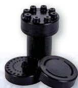
PLASTIC LILY, STARBURST & TRUMPET NOZZLES