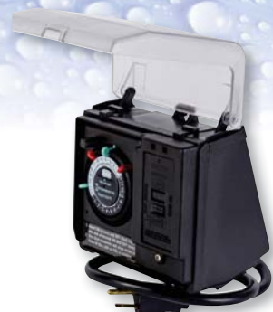
GFCI TIMER INCLUDED